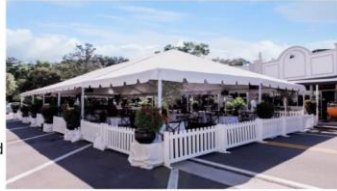
Image Source: https://www.sfbk.com/2020/05/22/online-let-notations-are-also-often-to-see-social-32-restrictions.html online news article by Kevin Starkiewicz, CNBC