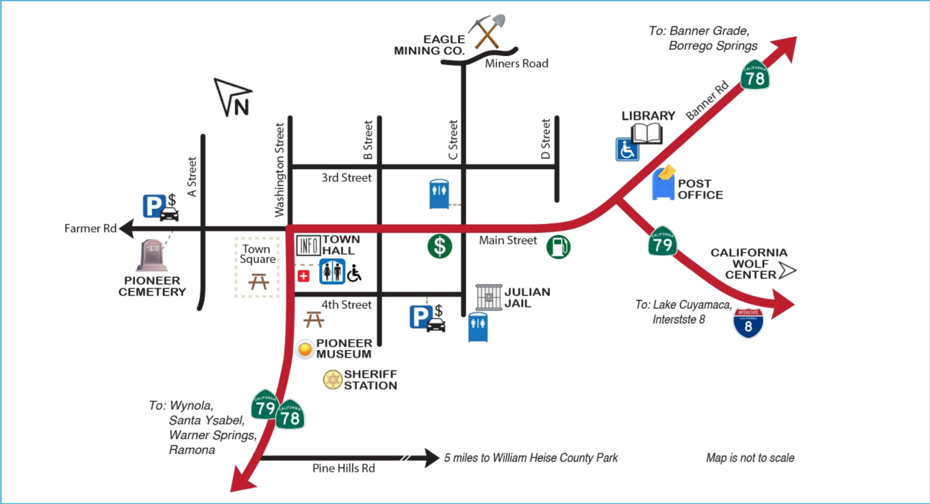
Area of Previous Map